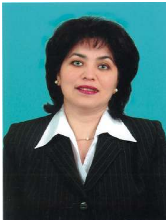
Aliya Tuygunovna Yunusova, deputy of the Legislative Chamber of the Oliy Majlis of the Republic of Uzbekistan

Interview with Aliya Tuygunovna Yunusova, deputy of the Legislative Chamber of the Oliy Majlis of the Republic of Uzbekistan