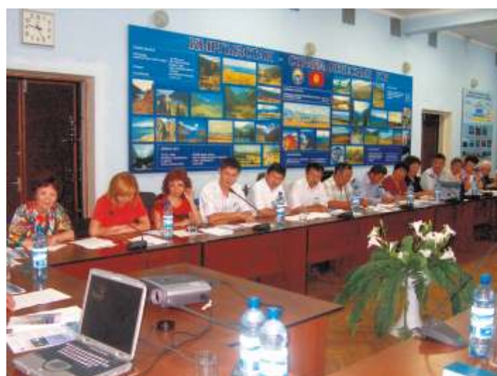
Workshop «Gender Aspects of Water Management in the Kyrgyz Republic»